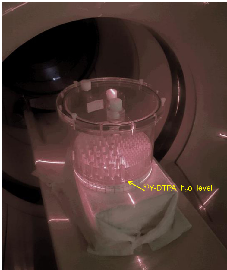
Fig. 1 Jaszczak deluxe phantom set in vertical position on a 20-cm-thick paper bloc modelling the conventional attenuation as only a part of the hot rod insert was filled with active solution in order to reach a typical clinical liver absorbed dose in selective liver ^{90}\text{Y} radioembolization

Two bed positions were acquired, and the times per bed position were 1.5 min for ^{18}\text{F} and 20 min for ^{90}\text{Y} , respectively. The ^{90}\text{Y} phantom was further imaged for 200 min per bed position after a 10- and 20-fold factor decaying; for this last setup, two slices were summed together to exactly compensate the activity reduction. The Philips Gemini TF64 system had a TOF-fwhm of 550 ps. Standard FDG reconstruction parameters were used for all the acquisitions, i.e. 3 iterations \times 33 subsets.